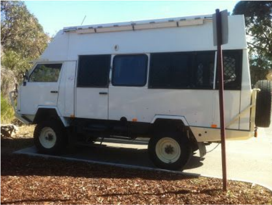
From OKA related

Things have not been good .Rina diagnosed with the big C.Just had operation and things are looking good.Hopefully they got it all and she will escape chemo and radiation.She is itching to get back on the road,a good incentive to get better len&rina