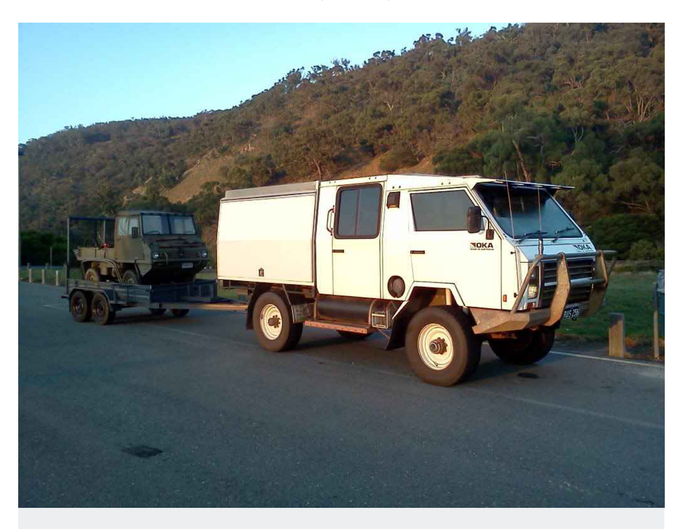
June 9, 2012 at 6:14 PM Flag Quote & Reply

Here's a pic of my OKA and Haflinger. Haffy is an ex Australian army vehicle of which they had 50 of in 1966. This pic was taken at Lake George NSW on my way to the annual ex military vehicle gathering at Corowa NSW.