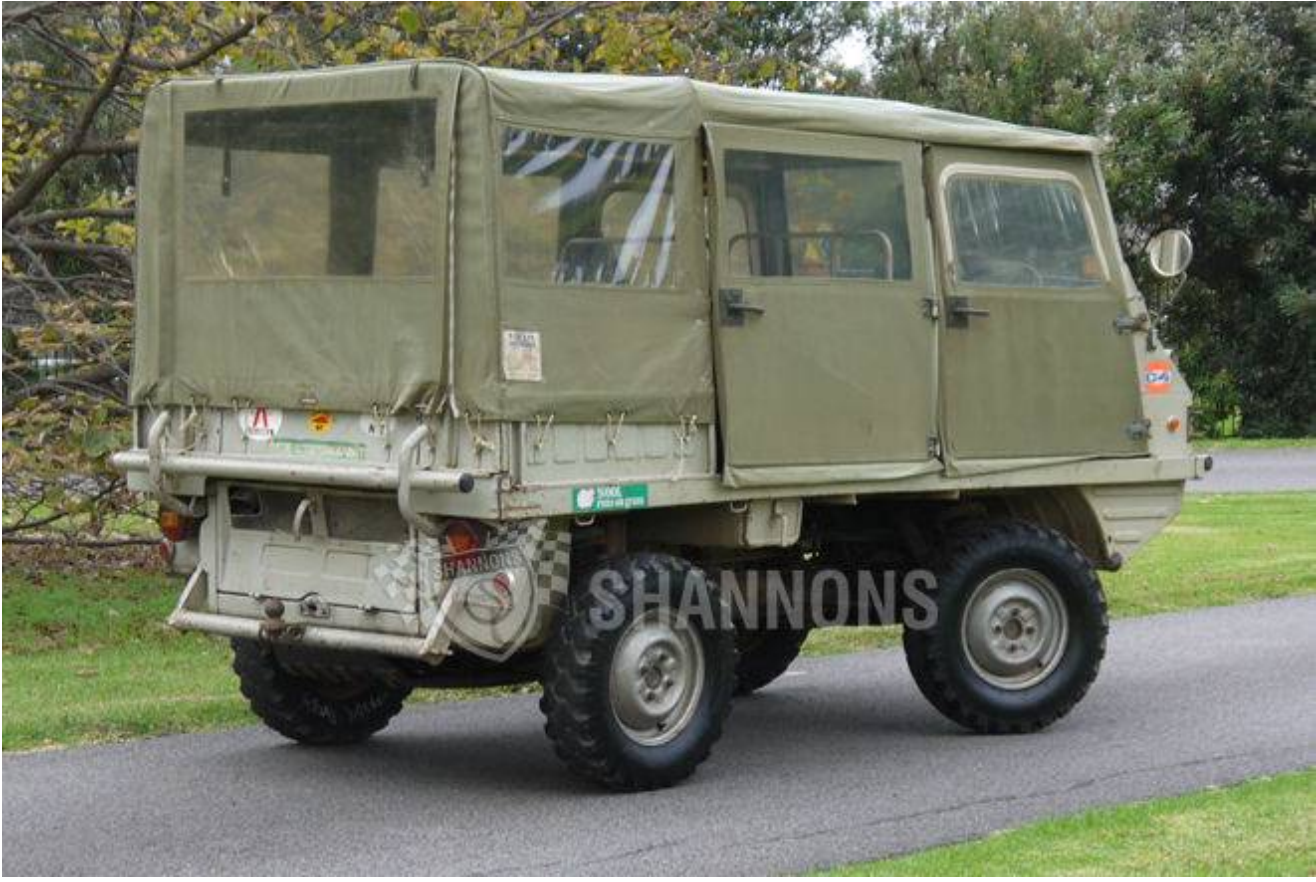
Shannons' text read: